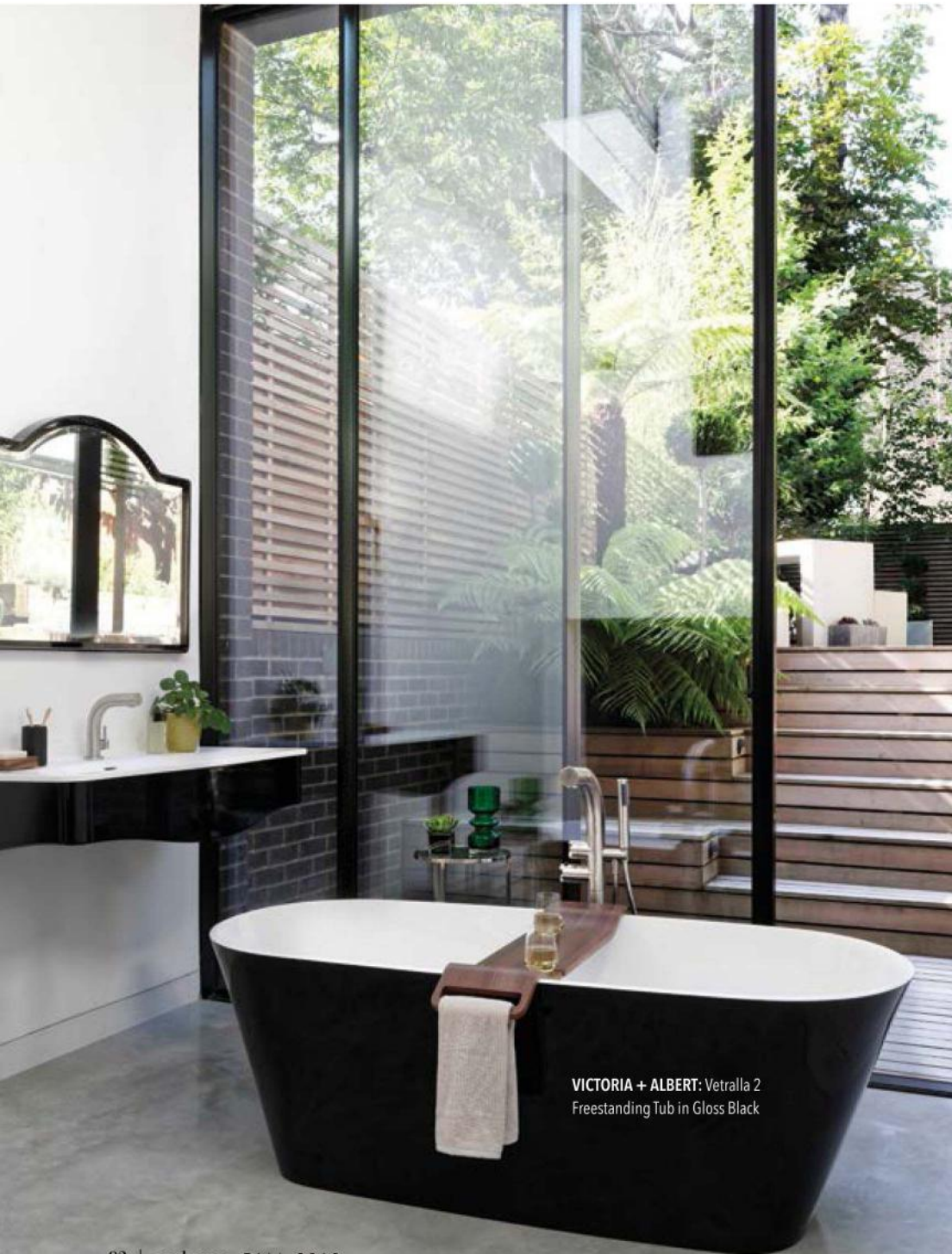
VICTORIA + ALBERT: Vetralla 2 Freestanding Tub in Gloss Black

I am a huge fan of the showering experience. However, when I was expecting my first child and suffering shin splints, I found a soothing bath something I couldn't get through the night without. When you need to get clean quick, a shower is hands-down the way to go. If, however, you find yourself with more than a few minutes, running yourself a bath can be a rewarding and comforting personal experience. Picking the right tub for you is important.