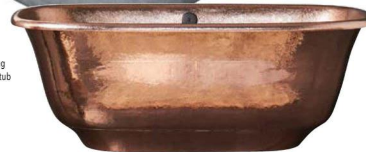
NATIVE TRAILS: Santorini Freestanding Copper Soaking Bathtub in Polished Copper

The best of both worlds. Get the modern style of a free-standing vessel tub, with the practicality of an enclosed tub.