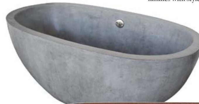
NATIVE TRAILS: Avalon 62 NativeStone Freestanding Soaking Tub in Ash